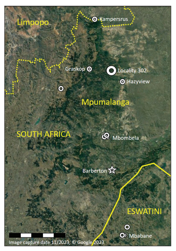
Figure 3. Location of Locality 302, the collecting site of the LUSSAE specimen attributed to Bactricia nematodes and neighbouring occurrences of Bactricia bituberculata in eSwatini and Mpumalanga and Limpopo provinces of South Africa. The dark areas are forest vegetation. ★ (white star) Type locality of Hyrtacus carinatus Kirby, 1902 (= B. bituberculatus (see Brock (2004)). Scale bar: 50 km.