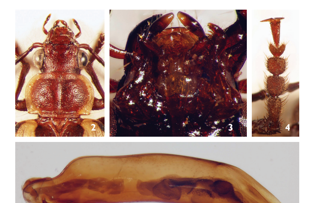
Figures 2–5. Lebistina rehagei sp. n. 2 head and pronotum (female) 3 head, lower side (male) 4 protarsus, lower side (male) 5 median lobe of aedeagus.

margin, forming a blunt tip. Striae slightly impressed and punctated; intervals flat, with two to five rows of irregular punctures, as some punctures fused to an irregular pattern. Four setiferous punctures in the third elytral interval.