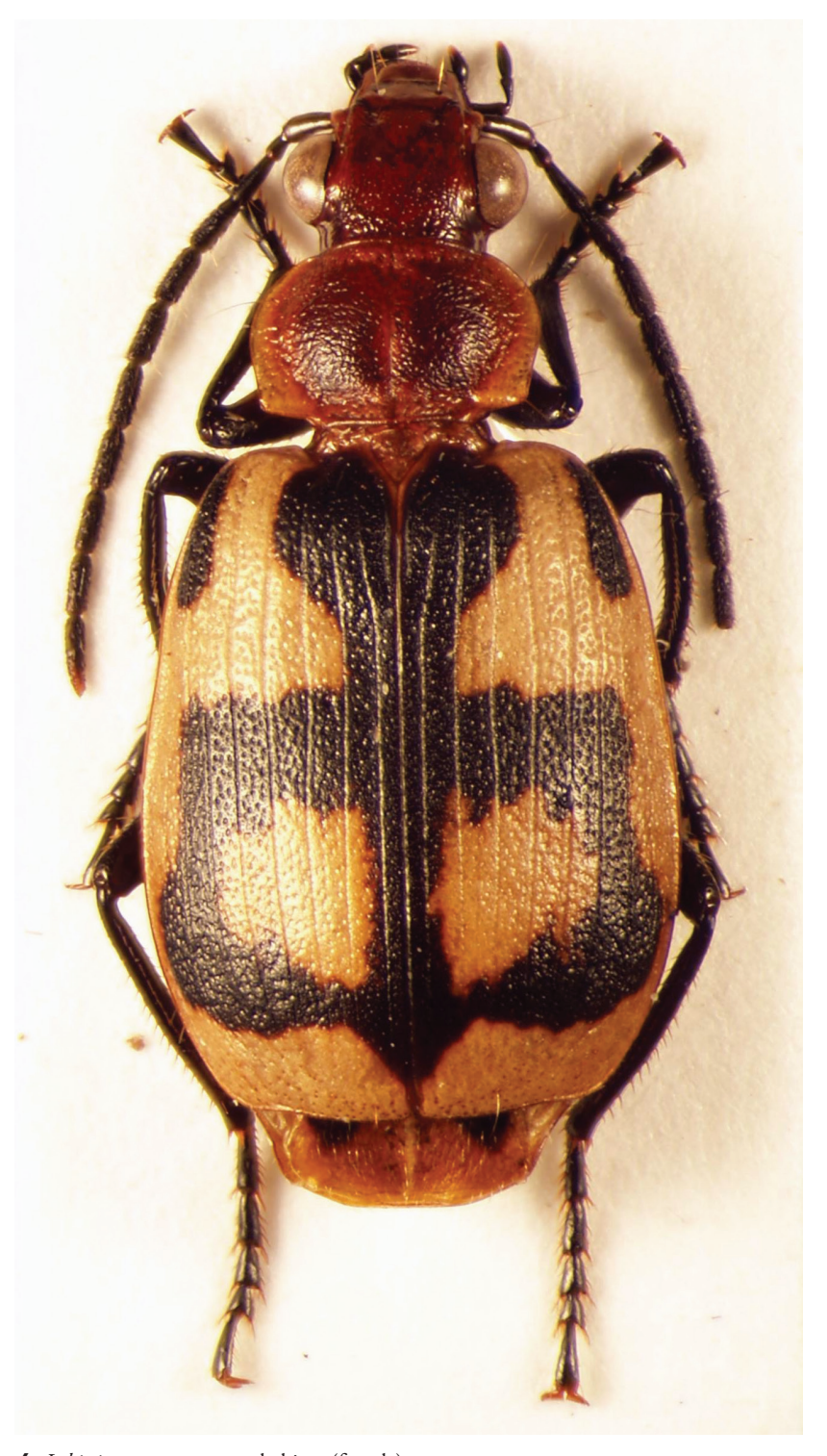
Figure 6. Lebistina petersae sp. n., habitus (female).