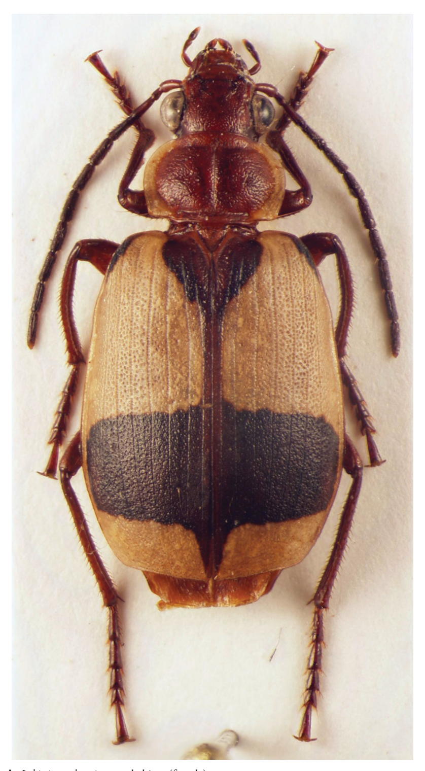
Figure 1. Lebistina rehagei sp. n., habitus (female).