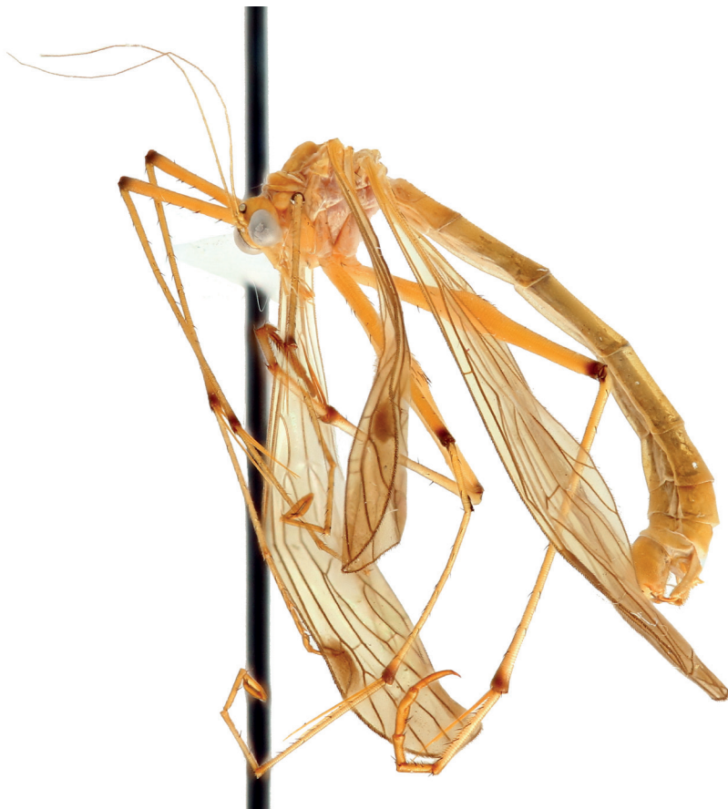
Figure 4. Lateral view of holotype male Bittacus londti sp. nov. (SAM-MEC A000068).

Male terminalia (Figs 9, 10). pale brown, matching the abdomen, with yellowish pubescence. Epandrium in dorsal view: outer margins subparallel, inner margins evenly curved; internal margin with short brown setae on apical half; In lateral view: ending