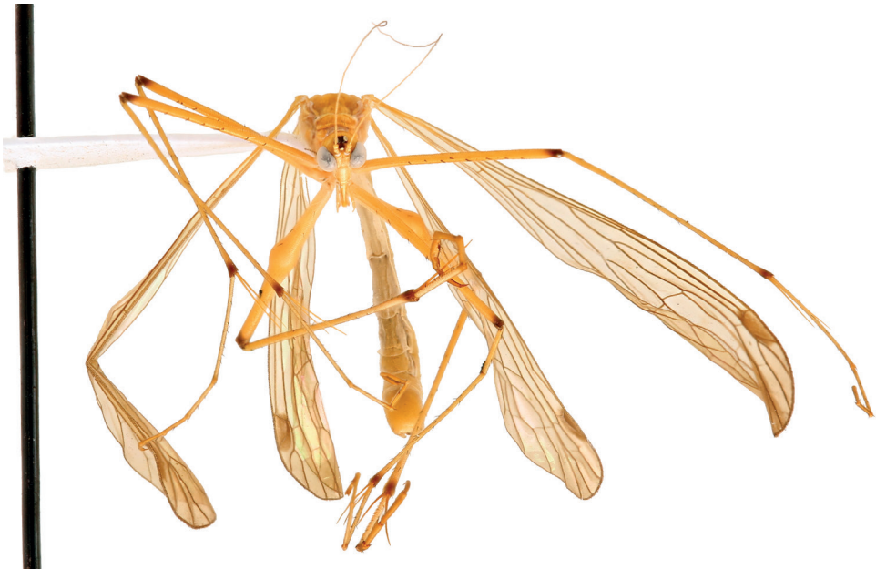
Figure 3. Frontal view of holotype male Bittacus londti sp. nov. (SAM-MEC A000068).