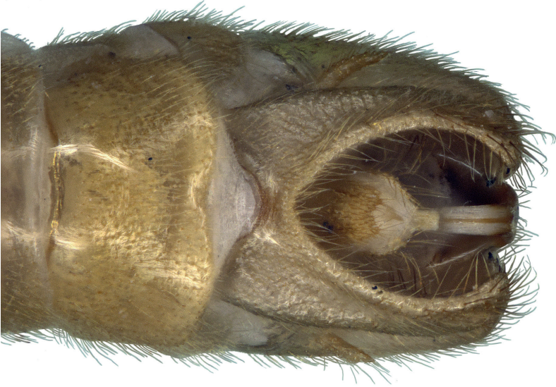
Figure 9. Dorsal view of the genitalia of holotype male Bittacus londti sp. nov. (SAM-MEC A000068).