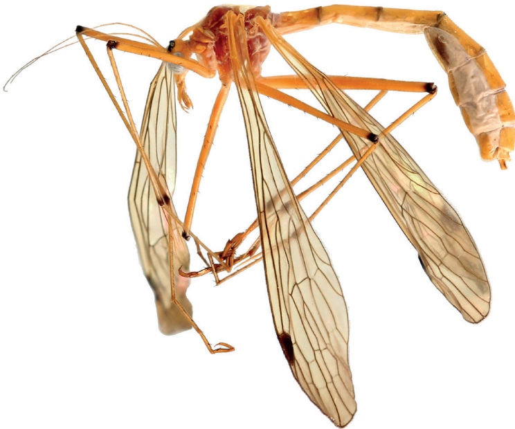
Figure 8. Lateral view of paratype female Bittacus londti sp. nov. (SAM-MEC A000067).