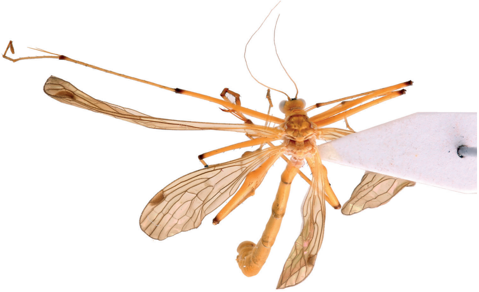
Figure 2. Dorsal view of holotype male Bittacus londti sp. nov. (SAM-MEC A000068).

mid tarsus 5.5:2.5:1.7:1.3:1.0; hind tarsus 1.9:1.1:1.0:1.6:1.6; female tarsomere ratios: fore tarsus 4.9:2.1:1.3:1.1:1.0 mid tarsus 4.6:2.1:1.3:1.0:1.0 hind tarsus 3.8:1.3:1.0:1.7:1.7