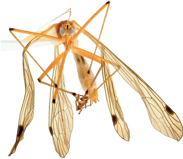
Figure 7. Frontal view of paratype female Bittacus londti sp. nov. (SAM-MEC A000067).