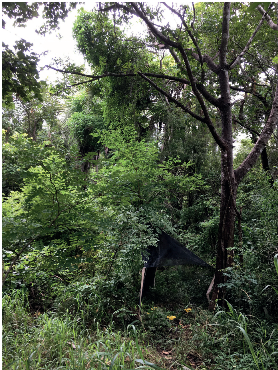
Figure 11. In situ photograph of the malaise trap at the collection site and habitat of Bittacus londri .