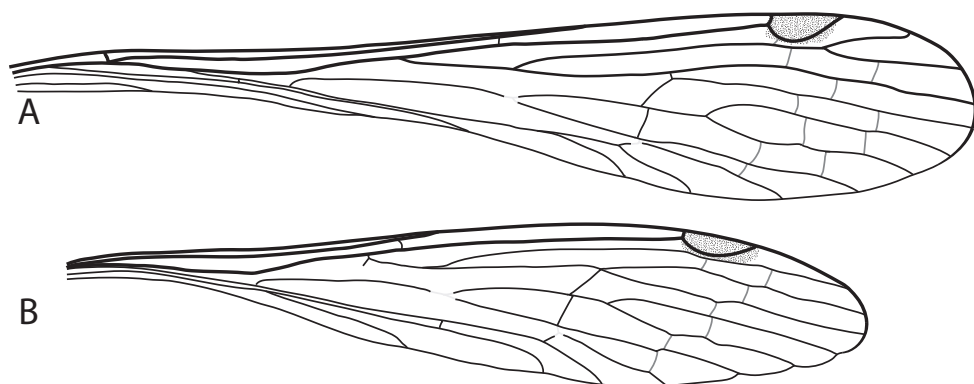
Figure 5. Wing venation of holotype male Bittacus londti sp. nov. A forewing, drawn from composite of left and right wing B left hindwing, digitally flipped. (SAM-MEC A000068).