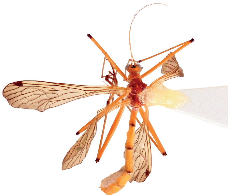
Figure 6. Dorsal view of paratype female Bittacus londti sp. nov. (SAM-MEC A000067).