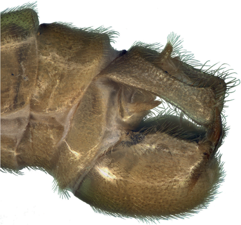
Figure 10. Lateral view of the genitalia of holotype male Bittacus londti sp. nov. (SAM-MEC A000068).